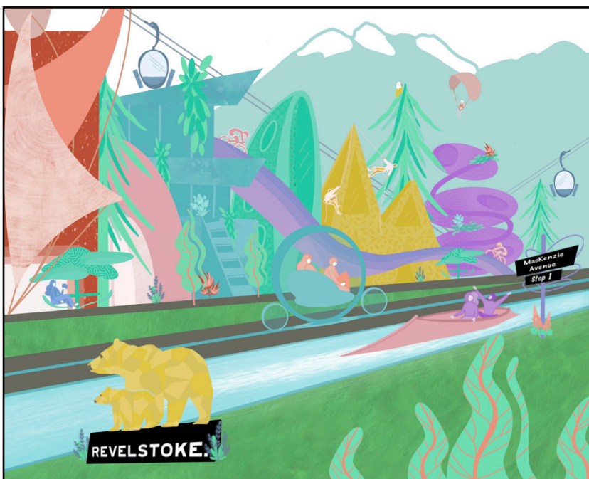
Revelstoke 2073 by Laurie Apeceche.

Let's plan for 50 years from now. Let's plan for 2073.