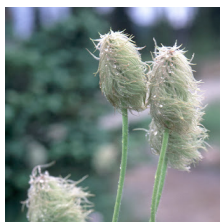
Western anemone ( Anemone occidentalis )