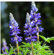
Arctic lupine ( Lupinus arcticus )