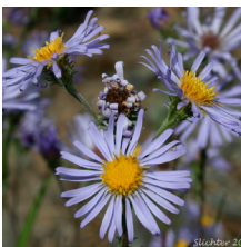
Subalpine daisy ( Erigeron peregrinus )