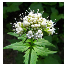
Sitka valerian ( Valeriana sitchensis )

To read previous Tourism Talks columns, check out seerevelstoke.com/about-tourism-revelstoke/